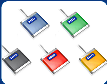
Color options / Accessory pack